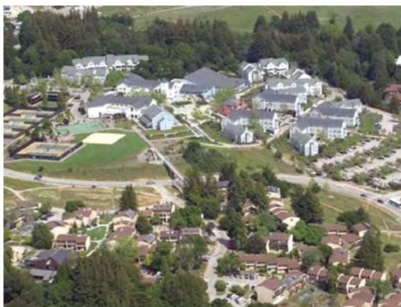
College Eight – one of ten undergraduate residential colleges providing a living and learning environment