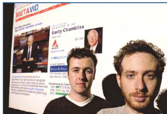
Two students in UCSC's new graduate program in Digital Arts and New Media make C-SPAN interactive

UCSC's graduate programs reflect the campus' long-standing commitment to fostering innovative, interdisciplinary research and teaching. Graduate programs at UCSC will continue to evolve in cutting-edge fields across the disciplines—as well as in the cross-disciplinary themes outlined in this strategic academic plan.