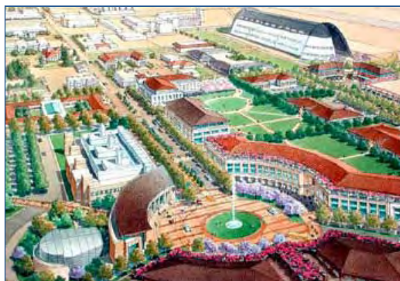
UCSC's Silicon Valley Center is based in the NASA Research Park and includes distance learning classrooms, faculty offices, and computer labs. Shown is an artist's rendition of the University Reserve.

Finally, an often over-looked but exceptional arena for border-crossing work is the college system. Aside from its interdisciplinary core course structure, colleges continue to house faculty offices and small research groups. To varying degrees based on their level of funding, they also sponsor upper division courses which draw upon the faculty fellows. Many of these courses are team-taught, uniting faculty from divergent perspectives. The independent nature of the colleges lends themselves ideally to an incubator for exploration across and between disciplines.