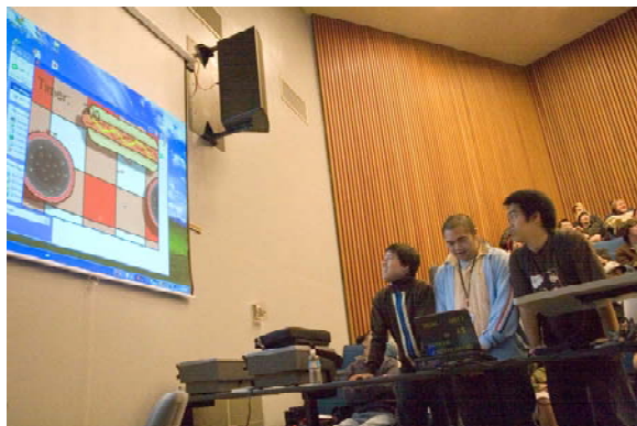
Undergraduate game design students demonstrate the game they created to their classmates.

A recurring theme in the Divisions of Arts, Engineering, Humanities, and Social Sciences is the role of public media, sound and visual media and the arts in transmitting not only knowledge but emotion, identity, and power. Throughout the disciplines, these studies incorporate reflection on how media are shaped and shape the artists and society in which they are produced and through whom and in which they occur, how they change the perception of those who hear or view them and how they are utilized to construct or deconstruct power and control. The production of art and communication occurs in many disciplines and our programs focus on critical choices made in production and documentation and how these are transmitted, altered and adapted.