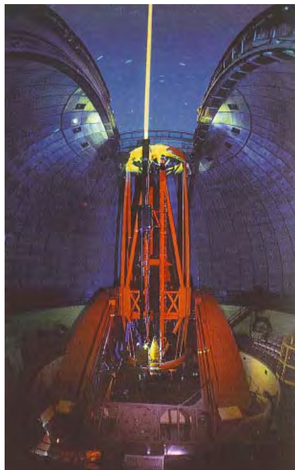
The adaptive optics system at Lick Observatory includes a laser-produced guide star that corrects distortions to incoming light caused by atmospheric blurring.

sustainable use of resources, as seen in the Divisions of Physical and Biological Sciences and of Social Sciences. Within these divisions are departments founded on the merging of disciplinary strengths. In addition, the campus has made a commitment to the research aspects through the STEPS Institute for Innovation in Environmental Research. This area also includes the functions of the earth as a planetary model, the factors that influence the movement of its continents and oceans, its climate and ecosystems and its ability to sustain life, and a broader understanding of how planets form and exist in the universe.